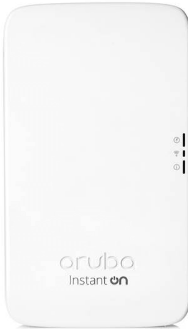
Aruba Instant On AP11D Desk/Wall Access Points

Whether you own a small law office or a trendy boutique hotel, your employees and customers are relying on the network for almost everything they do. And because Wi-Fi plays such a crucial role today, you need a purpose-built solution that keeps your business on the go. Aruba Instant On Access Points (APs) are easy to deploy and manage-with a quality look and feel at an attractive price point.